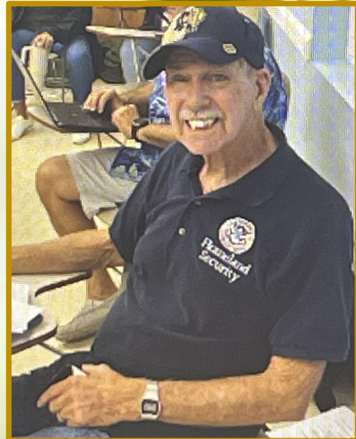
By: Robert Sajnovsky, FSO-MT

Ground tackle is a phrase that describes all the various elements used in anchoring a boat. Ground tackle includes the anchor , the anchor chain , the anchor line , the swivel-shackles that join the chain to the line and the chain to the anchor, and in larger vessels with lots of chain and heavy anchors, a windlass , or winch, that aids in deploying and weighing the anchor. A windlass may be powered manually or by electrical power and is fitted with a gypsy spindle that can accommodate both line and chain.